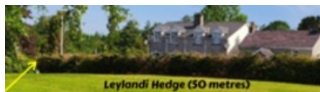
Leylandii Hedge (50 metres)

Kiltegan Tidy Towns volunteers in conjunction with residents will be removing the Leylandii hedging at the top of the Green on Saturday 6 th November 21 @9am.